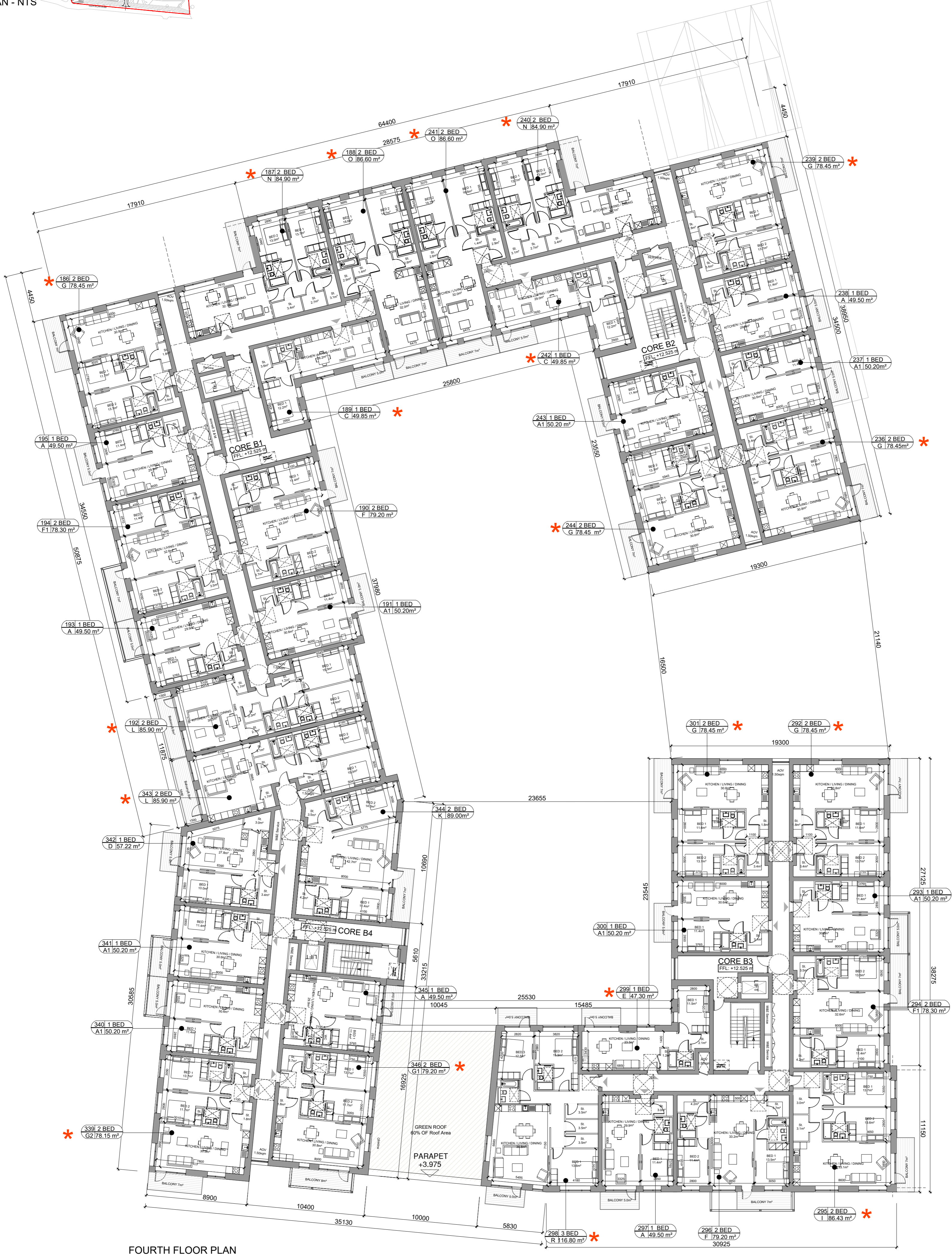
FOURTH FLOOR PLAN SCALE 1:200